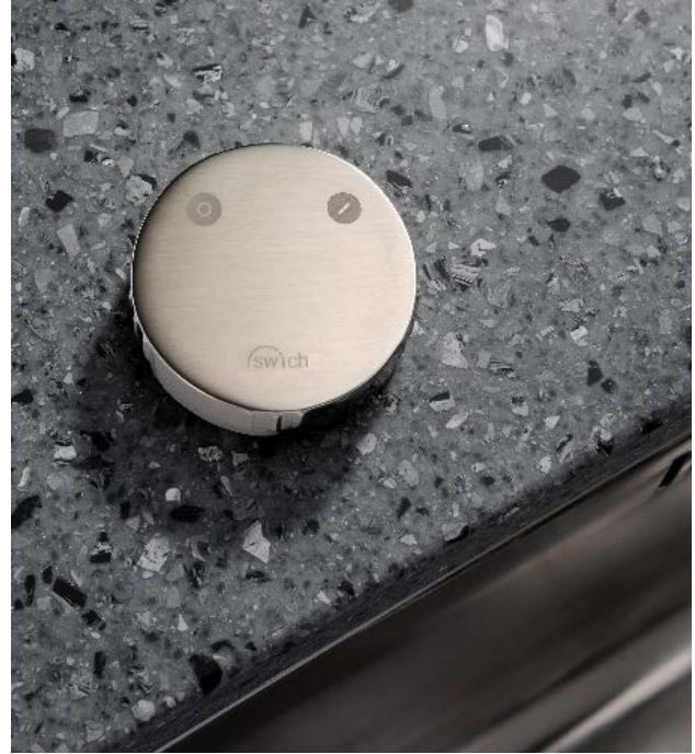
Swich Round Brushed Nickel: AT2051 (with GAC filter) AT2055 (with GAC and resin filter)