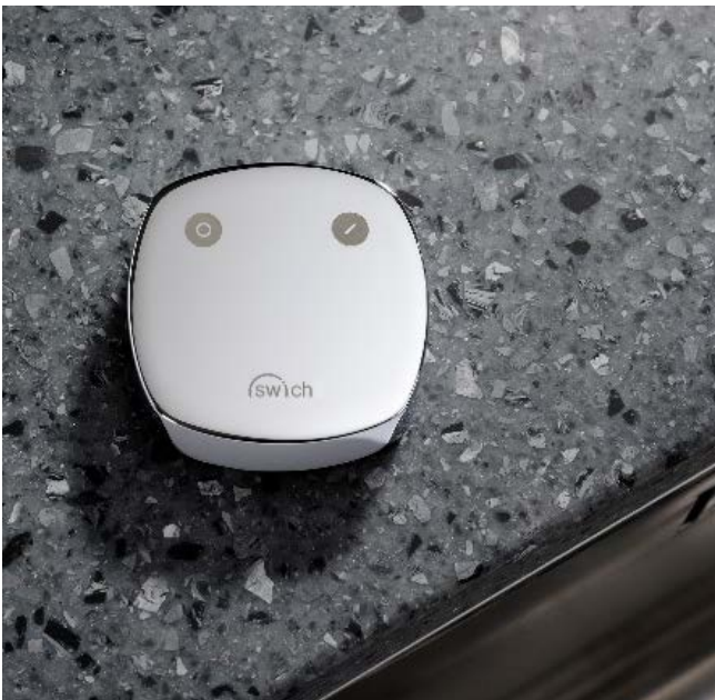
Swich Square Chrome: AT2052 (with GAC filter) AT2056 (with GAC and resin filter)