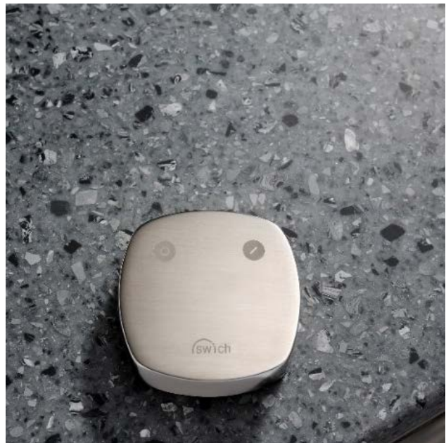
Swich Square Brushed Nickel: AT2053 (with GAC filter) AT2057 (with GAC and resin filter)