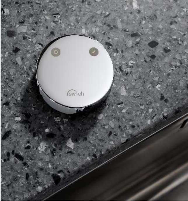
Swich Round Chrome: AT2050 (with GAC filter) AT2054 (with GAC and resin filter)